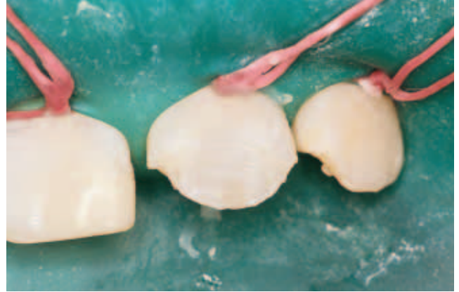
Fig 8 View of tooth 21 after preparation for a direct restoration. The anatomic post is used as a “base” for the resin composite restoration.