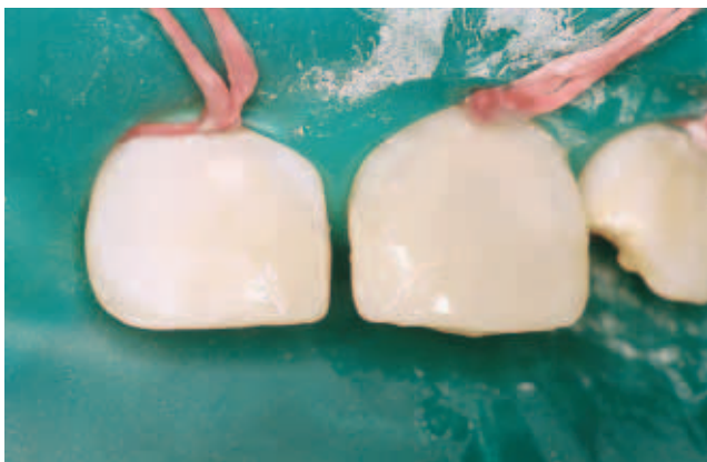
Fig 11 The restoration is completed with a translucent resin composite, used as “enamel” material.

an individualized post in only one visit, without laboratory involvement. In contrast, the classic post and core system, direct or indirect, requires at least two visits and a laboratory phase. This new technique is particularly advantageous in a case like the one described, where the young age of the patient called for treatment to be completed in few visits, with each one as quick and easy as possible. Additionally, if a prosthetic restoration is planned for the endodontically treated tooth, it is possible to immediately build up and prepare a resin composite core on the anatomic post.