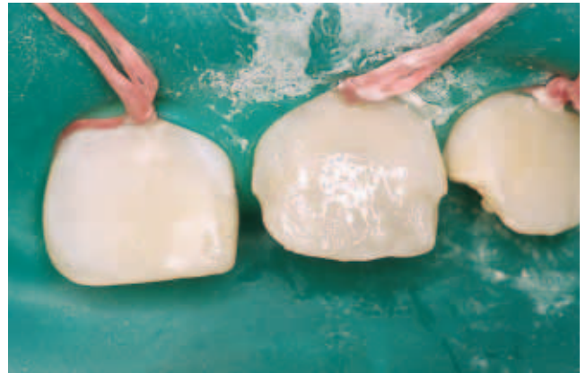
Fig 10 Opaque resin composite is used to build up the core of the tooth and to obtain the proper effect of opacity or to reproduce the natural opacity of the tooth.