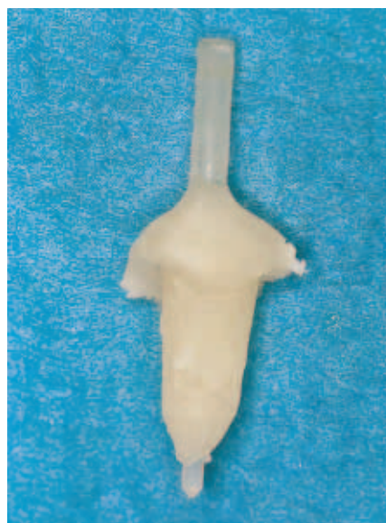
Fig 6 The individualized post as it appears after having been light cured outside of the patient's mouth.

It is not uncommon to observe a residual root canal shape after endodontic treatment which is not perfectly round. 3,17 This case is a suitable situation for using the anatomic post. In fact, in the attempt to place a conventional fiber post in such a canal, one would either be forced to round out the canal walls