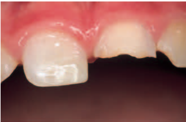
Fig 2 Endodontic treatment was performed on teeth 11 and 21. A direct composite restoration was placed on tooth 11.