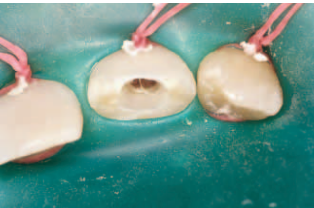
Fig 3 After rubber-dam placement, the wide and not perfectly round residual root canal anatomy is visible in tooth 21.

purpose of improving post retention when dealing with canals of elliptic shape, or exhibiting a reduced amount of residual root structure after endodontic treatment; this latter situation obviously contraindicates a further removal of dentin to make the canal shape match the post shape. The creation of an “anatomic post”, ie, shaping the post to the root anatomy instead of vice versa, is the procedure of choice in these clinical situations, of which the described case is an example.