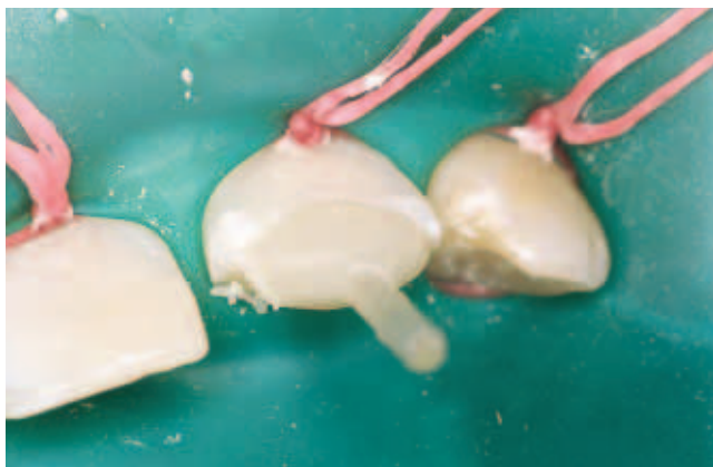
Fig 4 The post coated with light-curing resin is inserted into the root canal with the aim of adapting it to the canal shape (anatomic post).