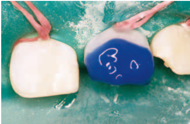
Fig 9 Etching procedure with phosphoric acid.