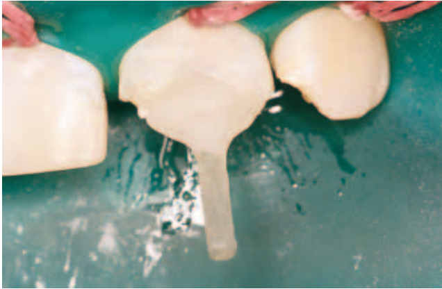
Fig 7 The post after the luting procedures.