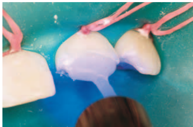
Fig 5 Light curing through the post (20 s) to polymerize the surrounding resin.

sional Dental Products, Jersey City, NJ, USA). Four to five coats of the one-step bonding system (Bisco) were applied into the root canals with a microbrush provided by the manufacturer. The excess primer-adhesive solution was removed with a paper point (Mynol), the cavity was gently air dried, and then the adhesive was light cured for 20 s.