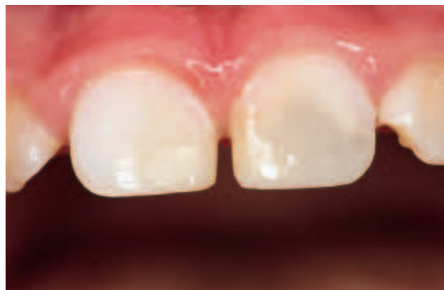
Fig 13 Facial view immediately after the removal of the rubber-dam.