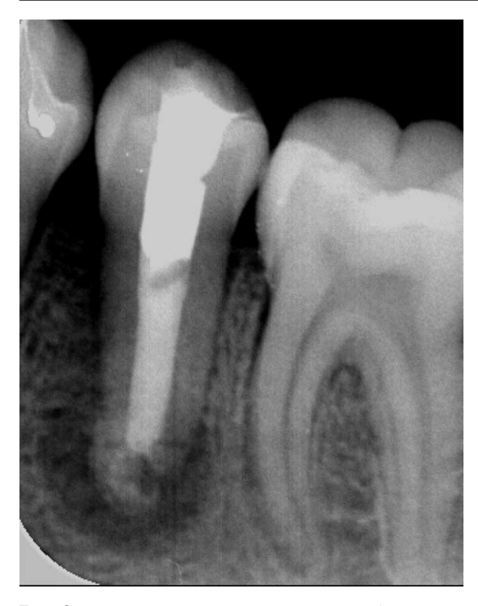
Figure 3. Tooth #20. Immediate posttreatment radiograph (November 17, 2003).

to white MTA for use as an apical plug (58). Some of these same studies suggest a one-step placement of the MTA root-end barrier (57, 59).