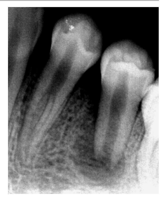
Figure 2. Teeth #20 and #21. Pretreatment radiograph (September 9, 2003).