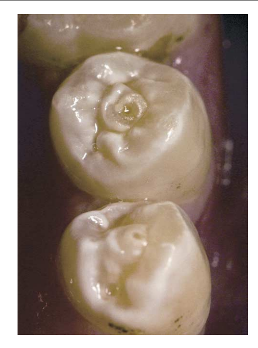
Figure 1. Teeth #20 and #21. Clinical pretreatment photograph (September 9, 2003).

The DE tubercles of posterior teeth average 2.0 mm in width (37) and up to 3.5 mm in length (9), and up to 3.5 mm in width and 6.0 mm in length for anterior teeth (17). Other than the cusp-like variable sized and shaped tubercle of teeth with DE, the remaining portion of the crown has a normal anatomy (6). This is an additional distinguishing characteristic from the accessory cusp of Carabelli, that when present,