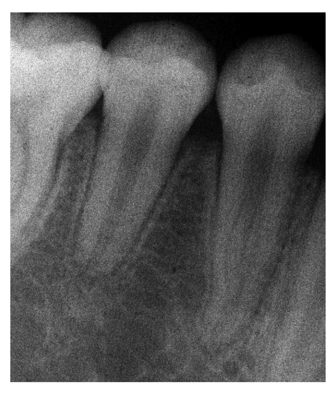
Figure 6. Teeth #28 and #29. Pretreatment radiograph (September 9, 2003).

of 16.0 mm. Because of the necrotic canal content, minimizing bacterial levels was aided by irrigation with 2.6% NaOCl and 17% EDTA during instrumentation, and a final flush with 0.9% sterile saline solution. After drying with paper points, the canal had a rinse with 2% chlorhexidine solution (Chlorhexi-Prep, Premier, Plymouth Meeting, PA) followed by placement of CaOH_2 paste (Pulpdent Paste, Pulpdent, Watertown, MA). The canal was sealed with cotton and Triage.