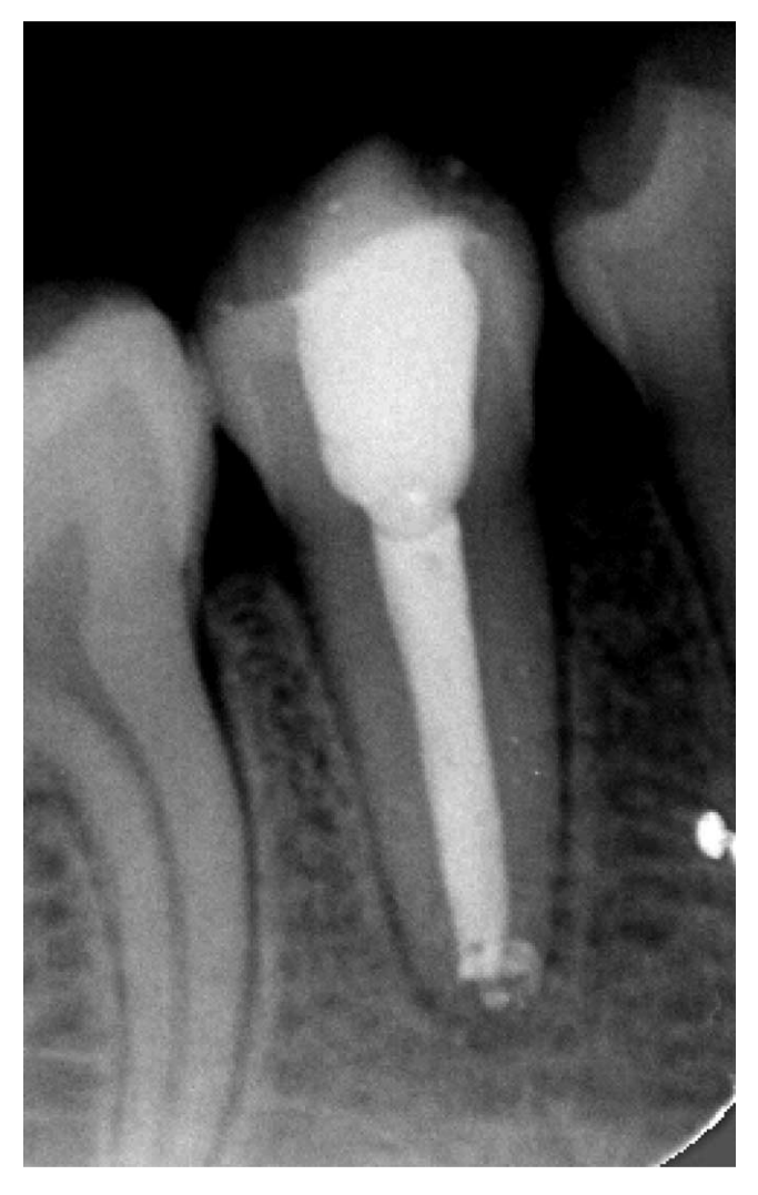
Figure 7. Tooth #29. Immediate posttreatment radiograph (October 3, 2003).

Both of the first premolars (teeth #21 and #28) were asymptomatic. Diagnostic pulpal and periapical testing of the teeth were within normal parameters, and radiographs demonstrated mature apices, a category type I for these teeth. However, radiographic images did reveal similar abnormal root formation for both teeth, with each exhibiting a main canal with trifurcation at mid-root into three slender roots (Figs. 2 and 6). If these teeth were someday to become pulpally involved, conventional root canal therapy would present a challenge.