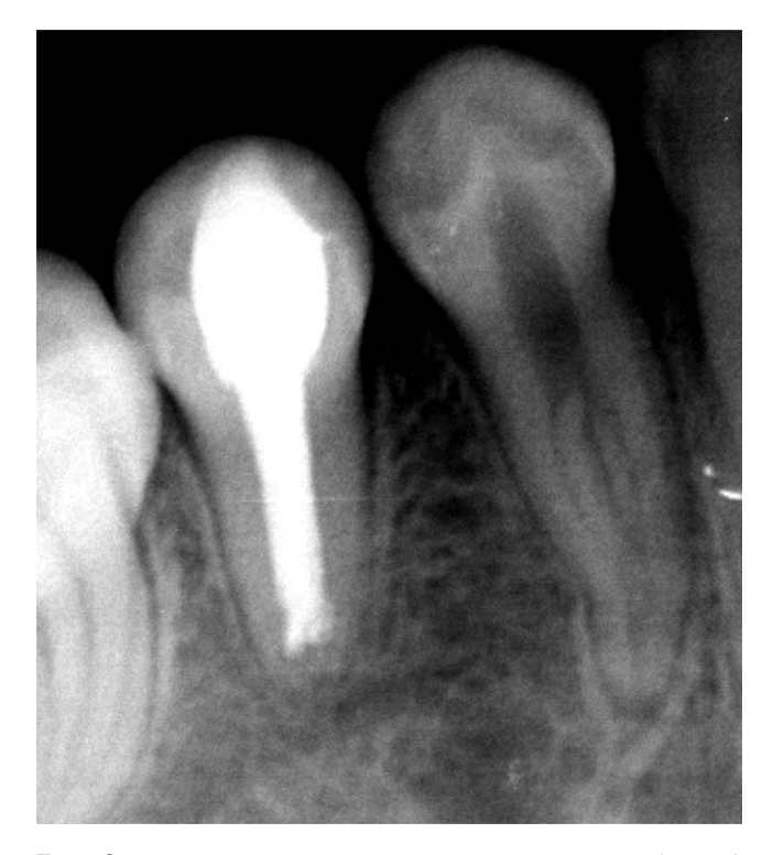
Figure 8. Teeth #28 and #29. Six month reevaluation radiograph (April 14, 2004).

The patterning cascade mode of tooth cusp development is not unlike the process of blood coagulation, where a progression of events in a particular sequence is dependent on several interacting factors. It is well known that genetic deficiencies for any of the required blood coagulation factors can variously alter the process, depending upon the factor involved. Likewise, gene mutations, interference with production of transcription factors, or inability to induce gene expression could cause induction of an uncharacteristic enamel knot late in the differen-