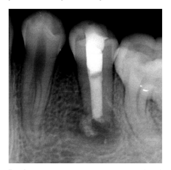
Figure 4. Teeth #20 and #21. Five month reevaluation radiograph (April 14, 2004).

The authors believe this to be a rare documented case of DE in a patient of Mestizo heritage. The earliest reported DE case in an individ-