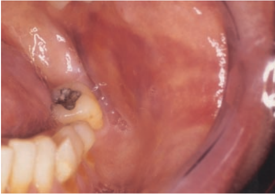
Figure 4 Large intraoral ecchymosis extending to the left cheek.