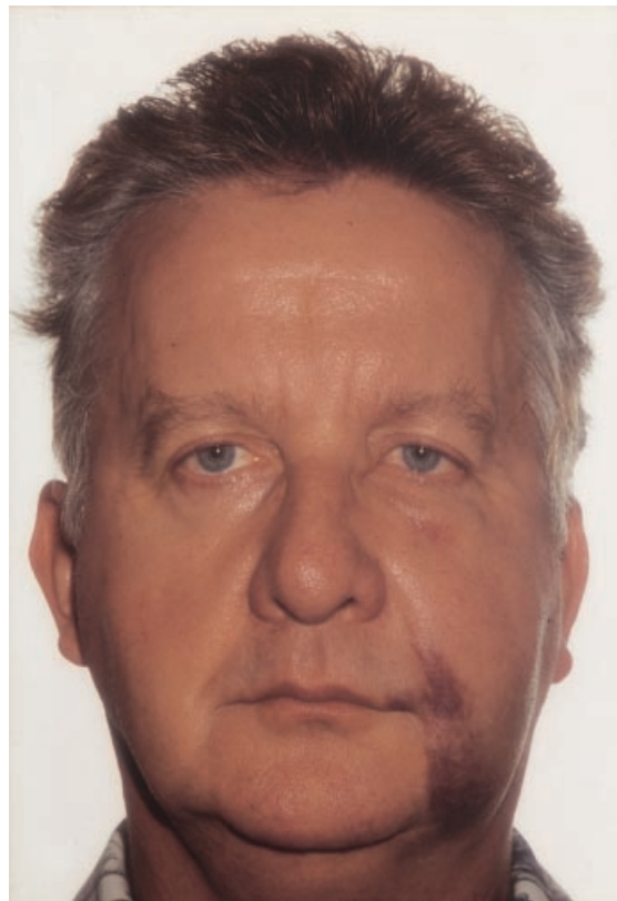
Figure 3 Swelling and extraoral ecchymosis following inadvertent extrusion of sodium hypochlorite (3%) through the apical foramen of a maxillary left cuspid.

Berg (1928), Müller-Stade (1931), Salvas (1931), Seidner (1938), Langegger (1950), Glahn (1953), Magnin (1958), Harnisch (1976), Spaulding (1979), Arnold (1979), and Hülsmann & Denden (1997). In an animal study the possibility could not be completely excluded by Rickles & Joshi (1963), that air emphysema during root canal therapy was the reason for the death of four of seven dogs. Similar dramatic sequelae following air emphysema after root canal treatment have not been reported in man.