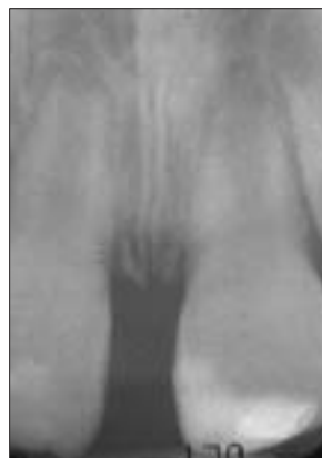
Figure 6d: Final radiographic appearance of the tooth after 6 weeks of treatment.

that a differentiation factor such as Emdogain could promote migration, proliferation and differentiation of PDL fibroblasts 30 within the adjacent alveolus to repopulate the PDL. 31