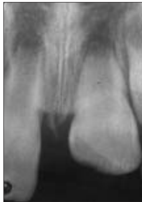
Figure 6b: Radiographic appearance of intruded tooth 21 in the same patient, also at the time of initial presentation.