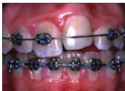
Figure 2: Infraocclusion of tooth 21 following replantation more than 3 hours after the initial trauma. Infraocclusion occurs when replacement root resorption (ankylosis) affects the teeth of young people with incomplete skeletal growth. Fusion between the teeth and the alveolus prevents the affected teeth from drifting with growth of the maxilla and thus distorts gingival architecture.