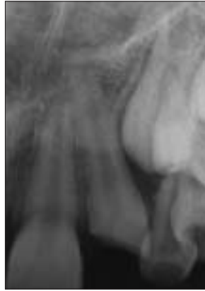
Figure 5b: Radiographic appearance after severe intrusion of tooth 22 in the same patient.