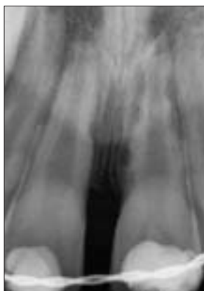
Figure 1: Two replanted central incisors affected by inflammatory root resorption. The process, characterized by bowl-shaped radiolucent areas, is initiated by infected dental pulp.