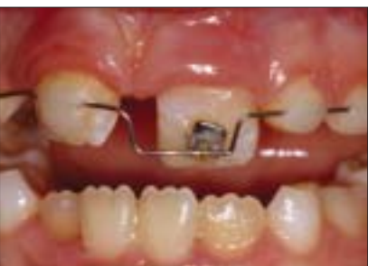
Figure 6c: The appliance employed for active repositioning of intruded tooth 21 in the same patient. Treatment was initiated at the time of initial presentation, and repositioning was accomplished over a period of 6 weeks. Restoration of the crown fracture was completed 7 days after the initiation of treatment.