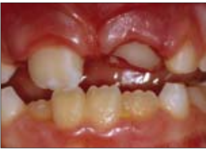
Figure 6a: Clinical appearance of tooth 21 intruded 4 mm at the time of initial presentation. A tooth with this much intrusion will not predictably reposition without traction.