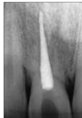
Figure 3: Radiograph of a central incisor affected by replacement root resorption. In the absence of infection, the process is progressive and results in eventual loss of the tooth.